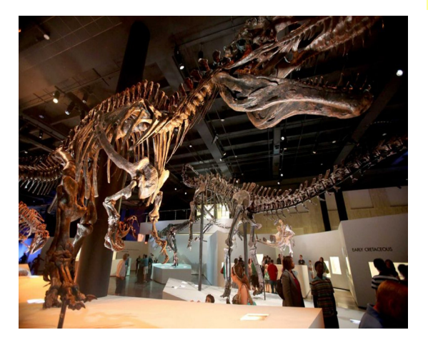
The Houston Museum of Natural Science